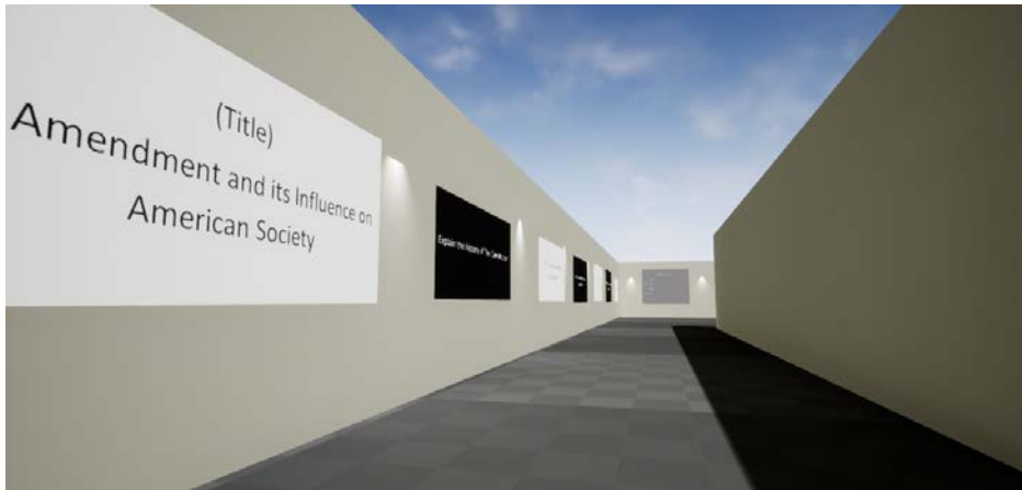
Figure 3: Hallway 1 in Level Space