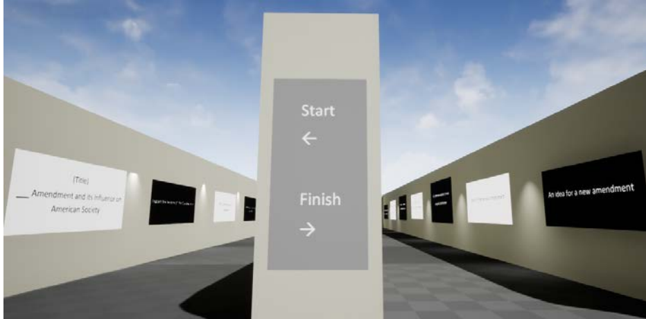
Figure 2: Player Start Position in Level Space