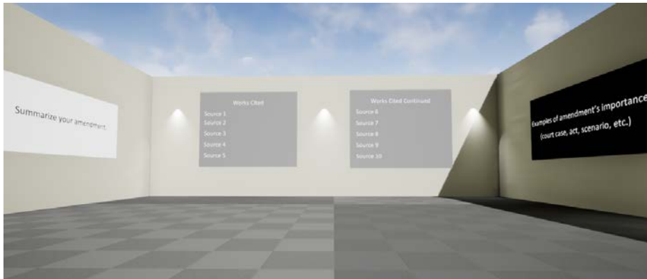
Figure 4: End of Hallway in Level Space