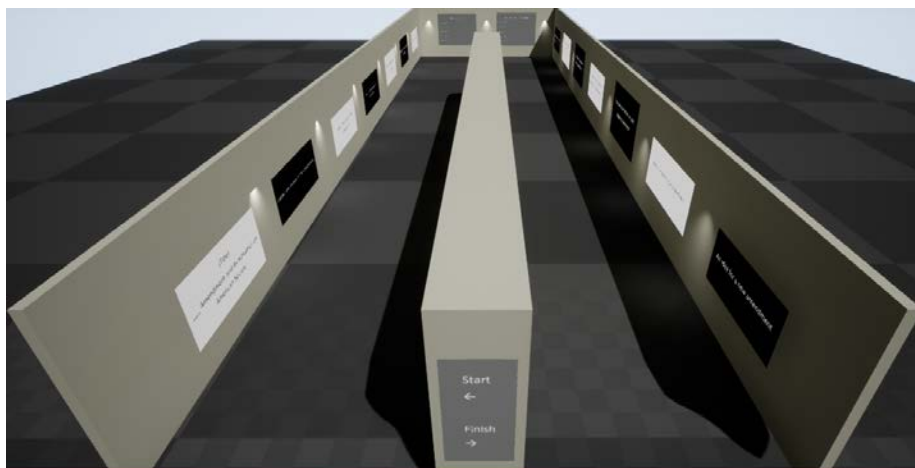
Figure 1: Top Overview of Sample Level Space

Students will display their content in a virtual hallway they create using the Unreal® Engine 4 software (see Figures 1 through 5).